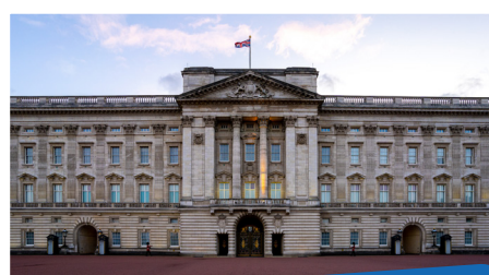
Walk through Buckingham Palace