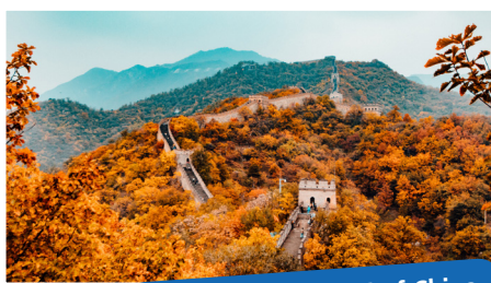
Walk the great wall of China

Have you found any virtual vacations that you love? Please share them with us!