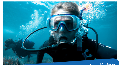
Always wanted to try scuba diving. Now is the time.