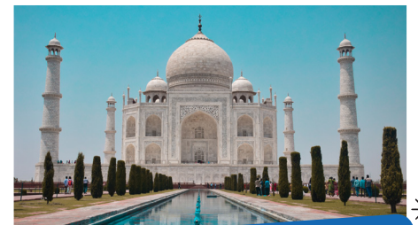
Explore the Taj Mahal