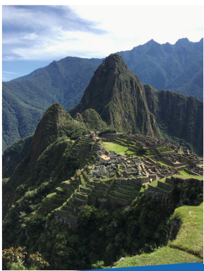
See the top of Machu Pichu