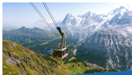
Travel through Switzerland