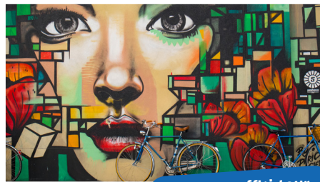
Take a graffiti tour