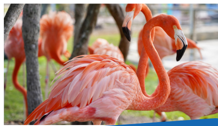
Visit the San Diego zoo