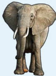
African elephants weigh up to 6,000 kilograms. (That's 6,000,000 grams!)